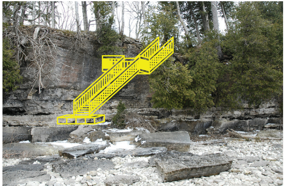
The shore of Port des Morts Park with a staircase extending to the shore